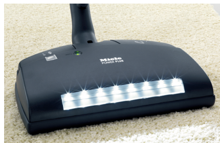
Electro Premium ( SEB 236 )