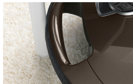
Exclusive velvet bumper strip