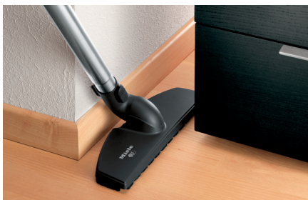
Parquet Twister ( SBB 300-3 )