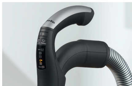
+/- Handle Controls