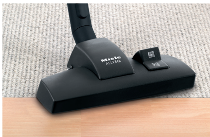
AllTeQ Combination Floor Tool (SBD 285-3)