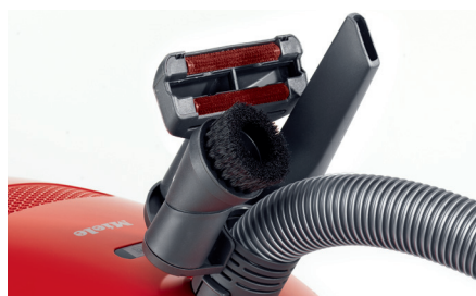
VarioClip™ with three accessories