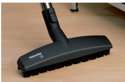
Parquet Floor Tool (Parquet-3)