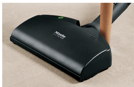
Electro Comfort (SEB 217-3)